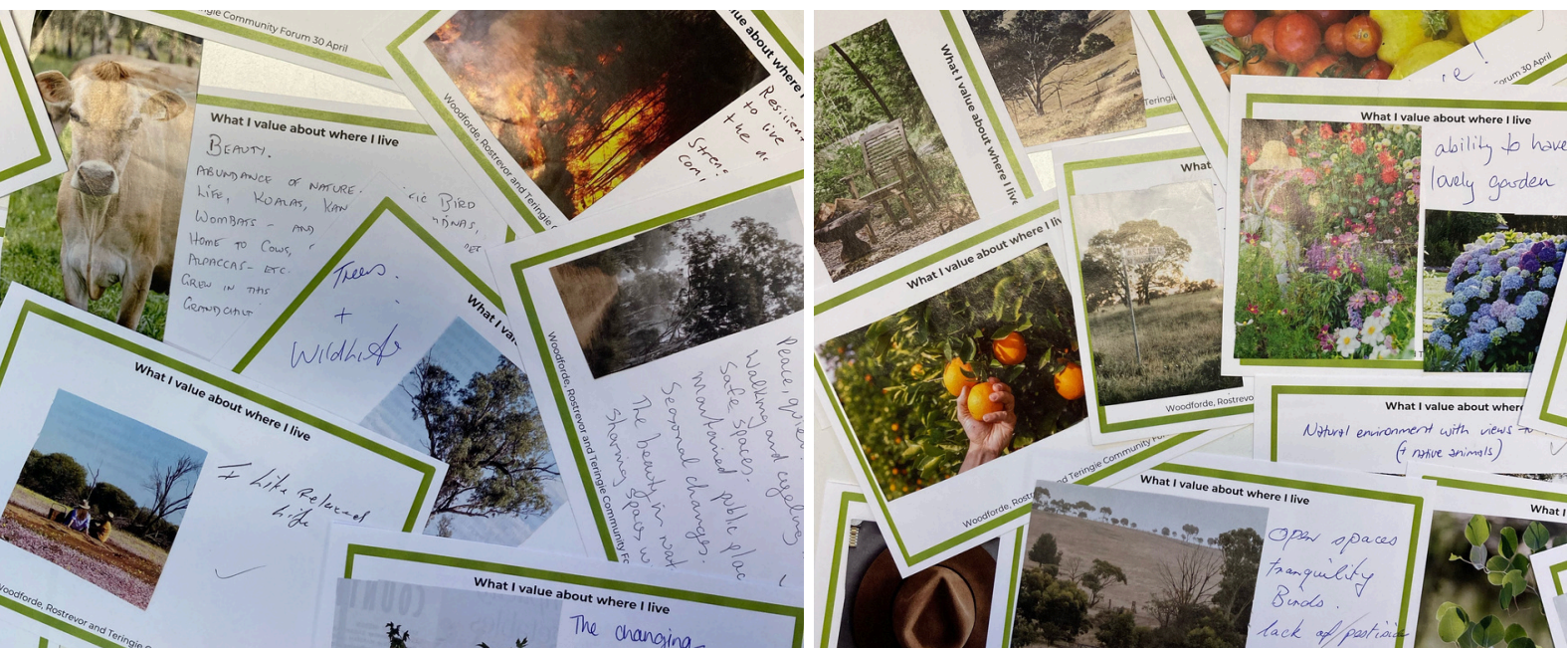
Images from participants Activity 2