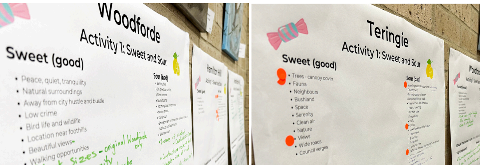
Images from participants Activity 1.